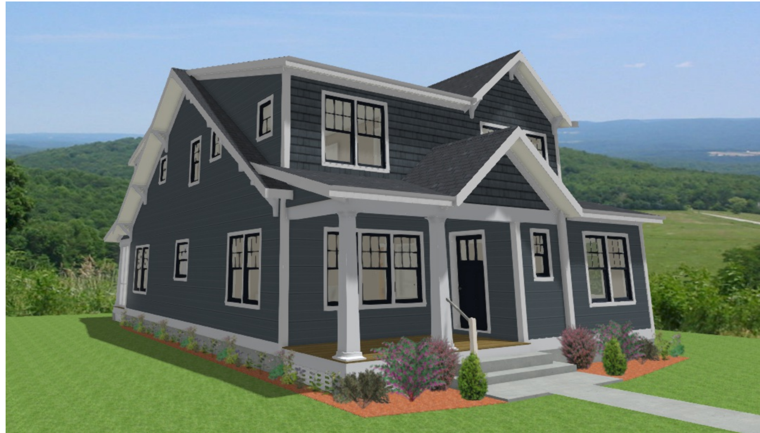
FRONT PERSPECTIVE VIEW NOT TO SCALE