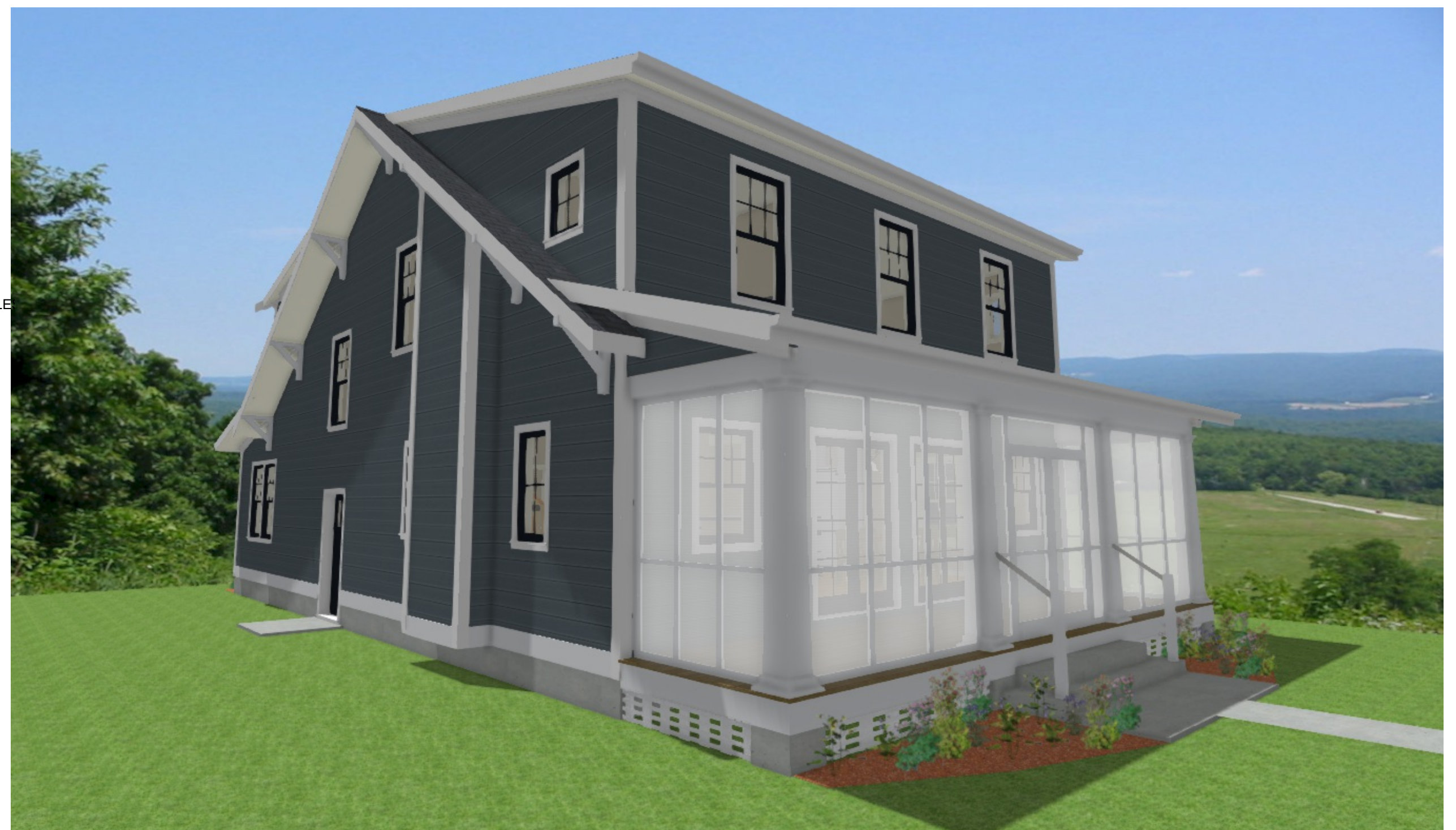
REAR PERSPECTIVE VIEW NOT TO SCALE